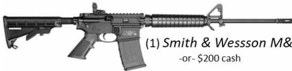
(1) Smith & Wesson M&P15 Sport II SKU10202 -or- $200 cash

5 winners chosen; prizes given in order drawn