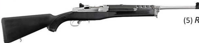
(5) Ruger Mini-14 Stainless Ranch Rifle SKU05805 -or- $250 cash