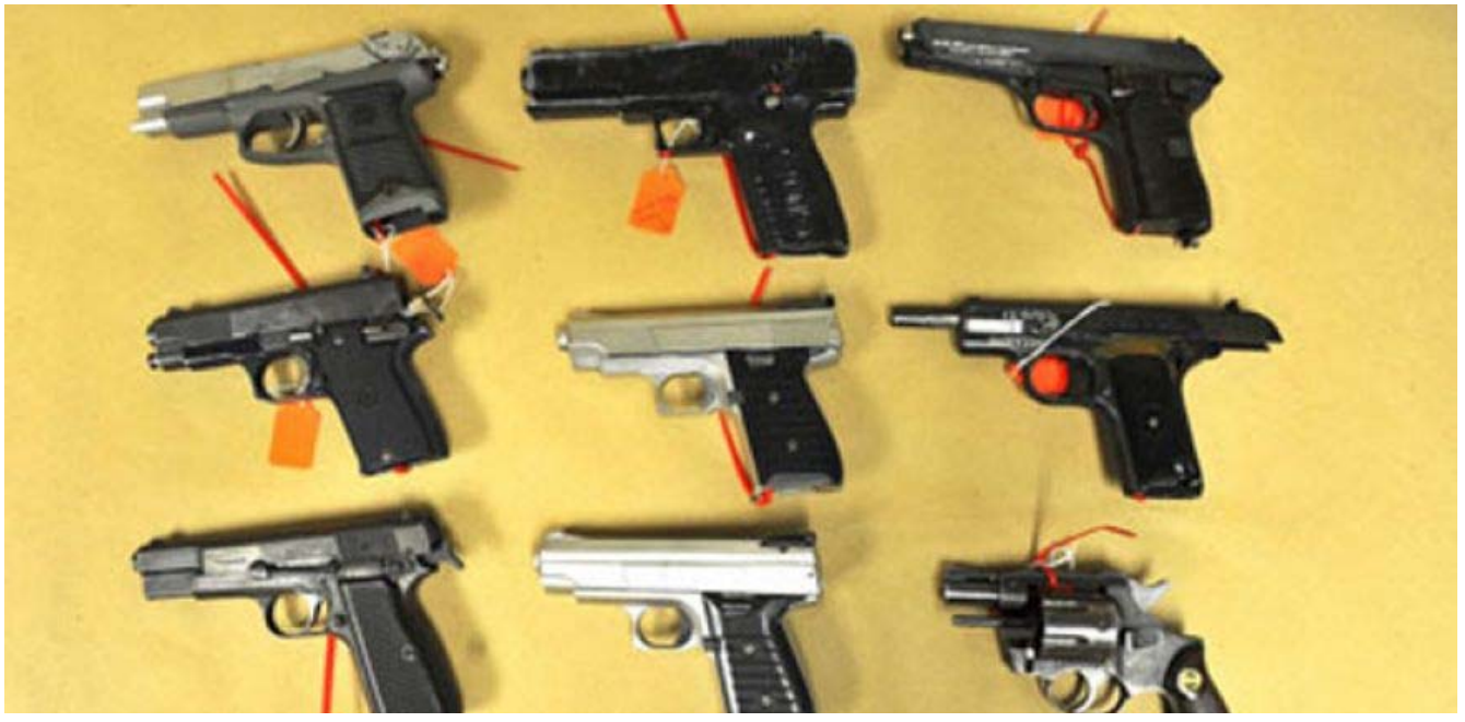
FILE 2012: Buffalo police confiscated nine illegal handguns in connection with a gun trafficking operation that stretched from the Decatur, Georgia area to Buffalo. The city has been focused on reducing the number of illegal guns on the street. (Buffalo Police Department)

A plan by police in Buffalo, N.Y., to begin confiscating the firearms of legal gun owners within days of their deaths is drawing fire from Second Amendment advocates.